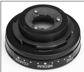
Fig. 2 (K) Upper Burr Disk