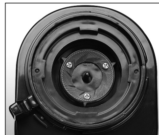
Fig. 5 (L) Lower Burr Disk with Upper Burr Disk removed