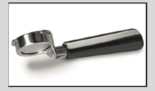
Use "Extra Fine" setting on Infinity Grinder and line indicator dot to 2<sup>nd</sup> or 3<sup>rd</sup> Extra Fine position*

*When using the bottomless filter, the grind size is critically important. Experiment and adjust the grind size for each brew. Different types of coffee may require a slight adjustment to the grind size. A conical burr grinder is needed to make these fine adjustments.