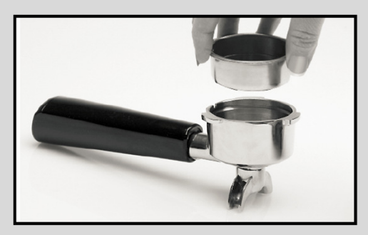
Use "Fine" setting on Infinity Grinder and line indicator dot to 1<sup>st</sup> or 2<sup>nd</sup> Fine position